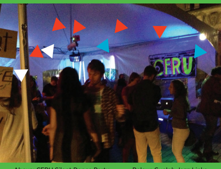
Above: CFRU Silent Dance Party Below: Guelph Jazz Links

Jazz Around Town venues each have various cover charges, tickets available at the door. Please check with the venue for details. All Guelph Jazz Festival concert & colloquium venues are accessible. Contact Jazz Around Town venues for accessibility information.