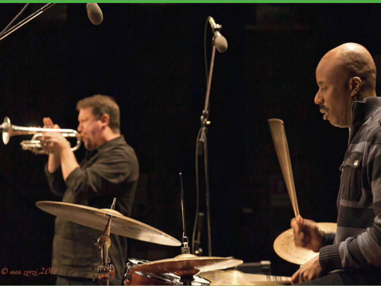
Chicago Underground Duo